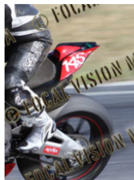
Numbers too small, fit side plates