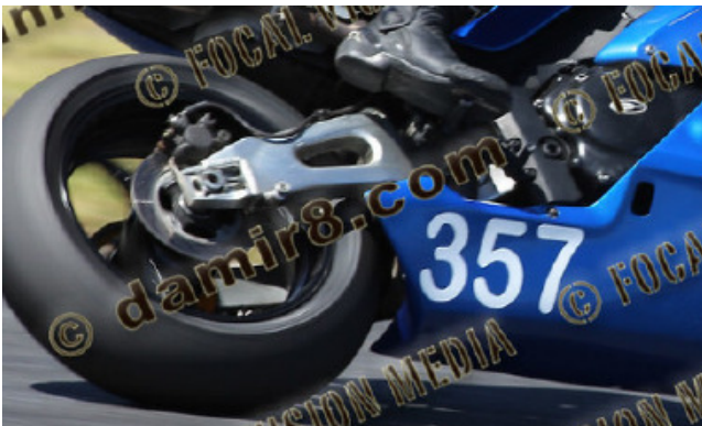
background wrong colour and no border