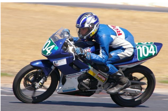
fit side plates or use 100mm Junior numbers