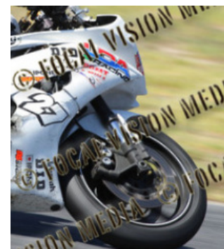
What's wrong - everything