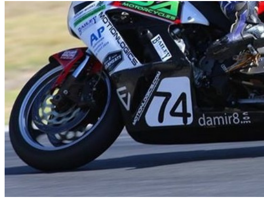
numbers too close to background edges