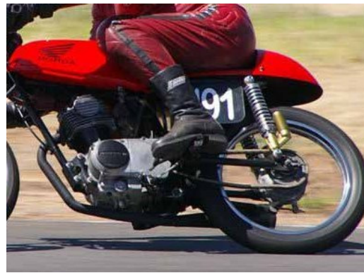
Number hidden by rider position