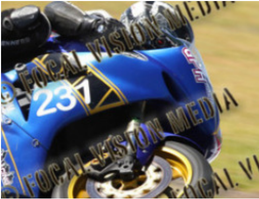
no background, no border